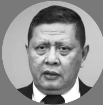
Dr. MARZUKI DARUSMAN Chairman